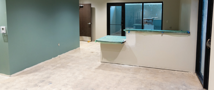
Progress at the Firestone Park building has been steady since the buildout began earlier this year. From removal of existing walls to the installation of new mechanicals, walls, and flooring, the building has been completely renovated.